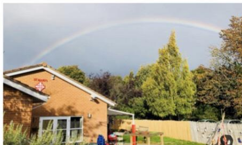
Disappointingly, we were unable to find the pot of gold in the school hall.

These opportunities are very valuable for staff and governors alike to get a better and broader understanding of life at the school.